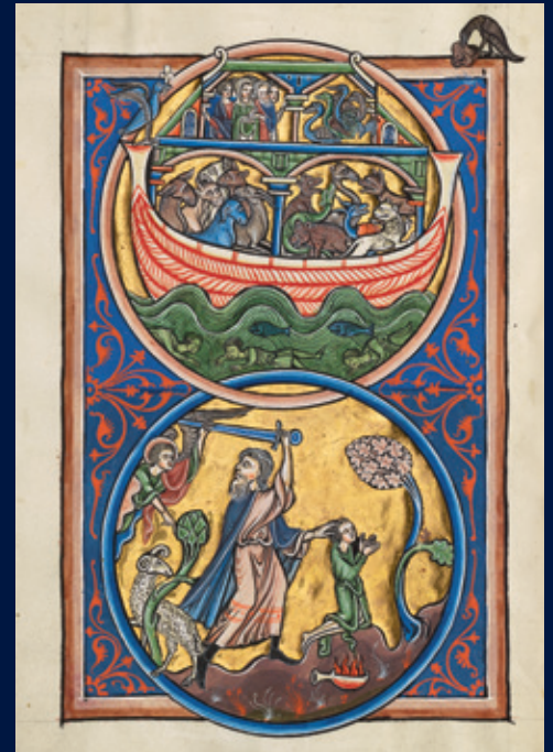
Right: Fol. 13v, Noah's Ark (above); Abraham and Isaac (below).

The open volume shows fol. 9v and fol. 10; left: The Fall of the Angels; right: God creates Eve from Adam's Rib.