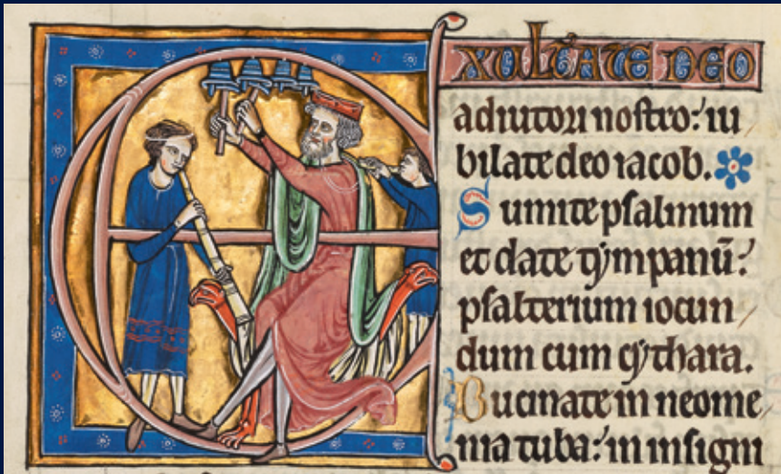
Fol. 105v (detail), Initial E.

Psalters used to be the richest illuminated manuscripts in the history of book art. The Royal Psalter (Bibliothèque de l' Arsenal, Ms. 1186), dated 1230 and presumably created for Blanche de Castille, the mother of King Louis the Saint, is no exception in this respect. Originated at a time when Paris became the most important center of manuscript production in Europe, inspired by the luminosity of gothic cathedral windows, this codex with its ornate miniatures and luxurious gold decoration is undoubtedly one of the most beautiful creations of French book illumination in the 13 th century. For the first time this fascinating artwork is now published as a true-to-the-original Fine Art Facsimile Edition.