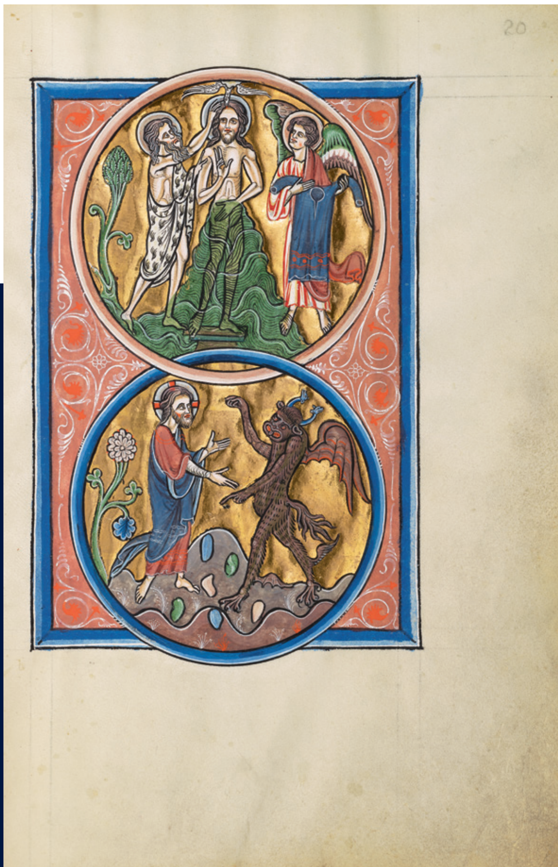
Fol. 20: Baptism of Christ in the river Jordan (above); the Temptation by the devil (below).