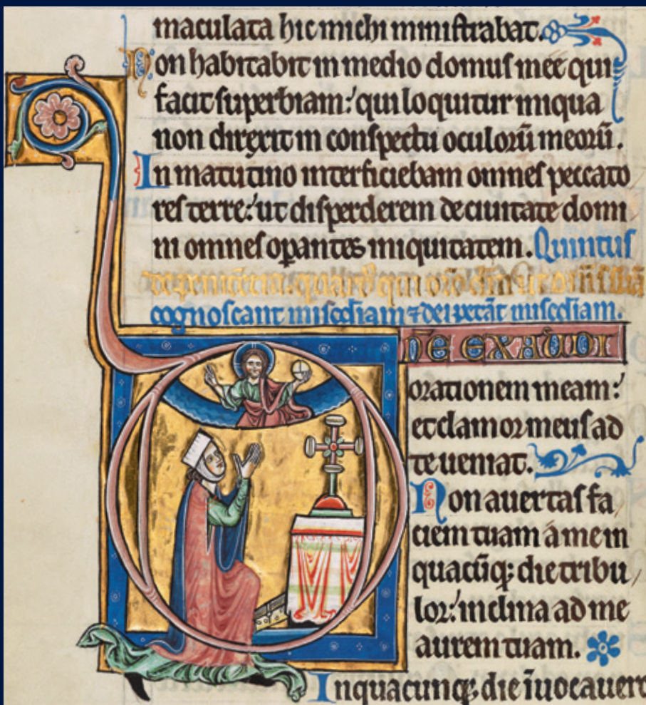
Above left: fol. 40r (detail), Initial C.