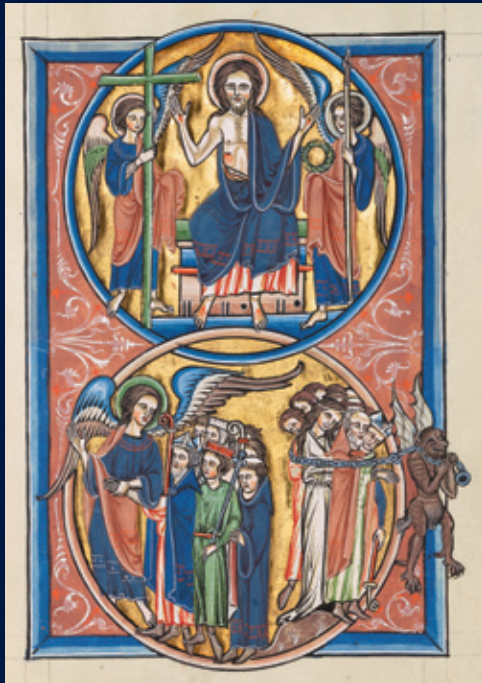
Left: Fol. 170, Christ as the Judge of the World, separating the Righteous and the Accursed.